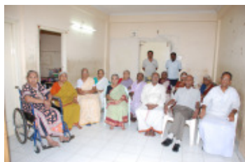
Home for the Aged