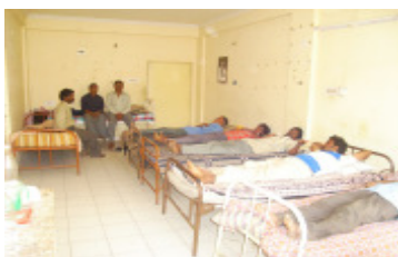
Drug De-Addiction Centre