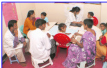
Early Intervention Services for Hearing Impaired