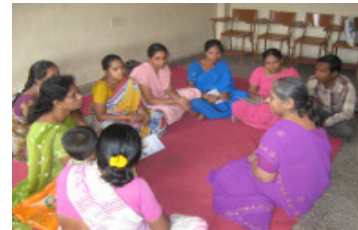
Children with ADHD & Autism