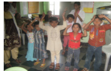
Centre for Learning Disorder