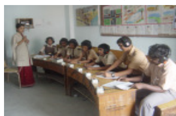
Special School for Deaf