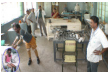
Artificial Limb Centre