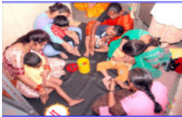
Children with Developmental Delays