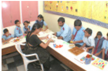
Hyderabad Special School for Mentally Challenged